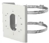
DS-1275ZJ-S-SUS Vertical Pole Mount