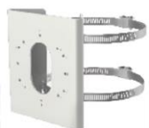
DS-1275ZJ-S-SUS Vertical Pole Mount