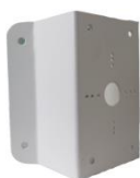
DS-1276ZJ-SUS Corner Mount