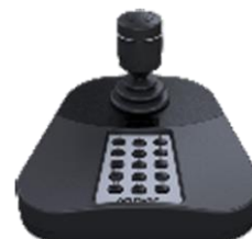
DS-1005KI USB Joy-stick