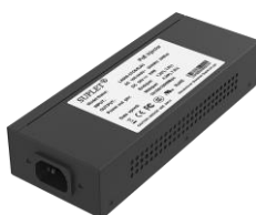
LAS60-57CN-RJ45 Hi-PoE Midspan