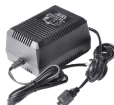
TEAC-66-243000V (EU) MKAC-66-243000U (USA) TEAC-66-243000VB (UK) Power adapter