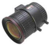
HV3816D-8MPIR 3.8~16mm DC Iris Lens HV3816P-8MPIR 3.8~16mm P-Iris Lens