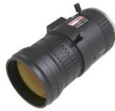
HV1140D-8MPIR 11~40mm DC Iris Lens HV1140P-8MPIR 11~40mm P-Iris Lens