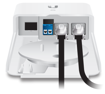
24V (4-Pair) 24V (4-Pair) DC Input Power and Data to PoE Device