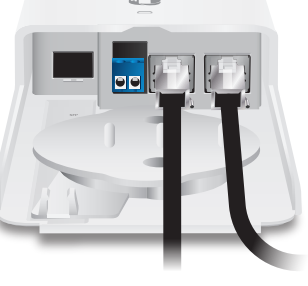
24V (2-Pair) 24V (2-Pair) DC Input Power and Data to PoE Device