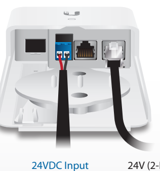
24V (2-Pair) Power and Data to PoE Device