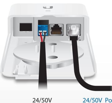
24/50V 24/ DC Output from Po