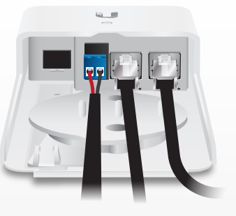
24/50V 24/50V 24/50V DC Output DC Input Power and Data to PoE Device