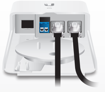
50V (4-Pair) 50V (4-Pair) DC Input Power and Data to PoE Device