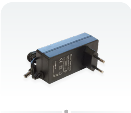
24 V 1.5 A power adapter