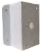
DS-1276ZJ-Y Wall Mount