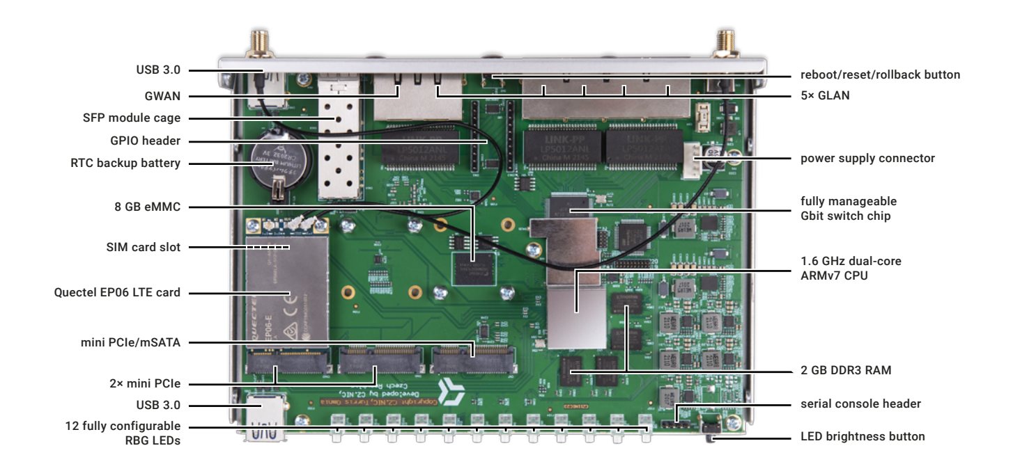
Turris Omnia 4G: motherboard components