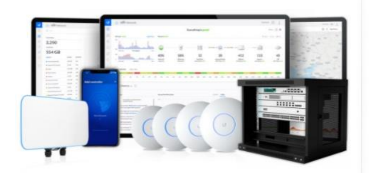
Step 3 of 6