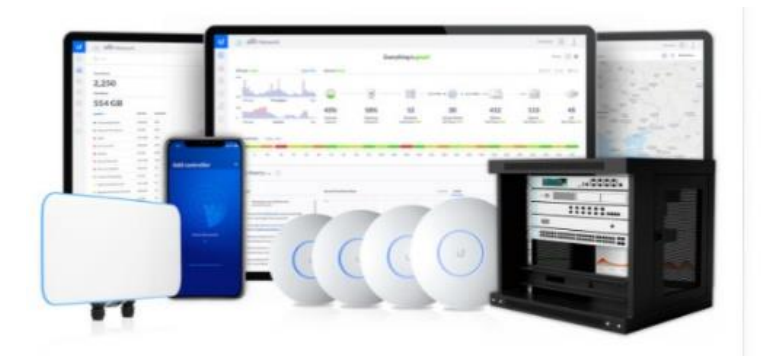
Step 4 of 6