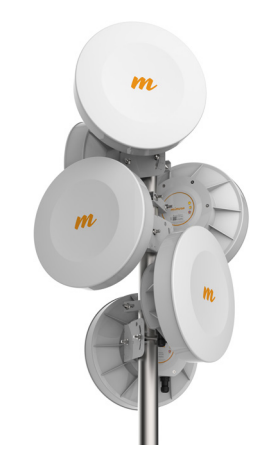
B5: 6 Dish Collocation